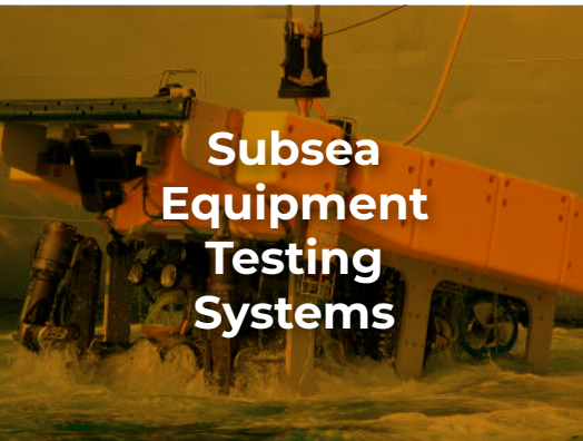
Subsea Equipment Testing Systems

Upon successful customer sign off, Denatec carry out formal training in the correct and safe operation of the equipment, issuing the final technical documentation and certification upon completion. Written Schemes of Examination can also be provided if required.