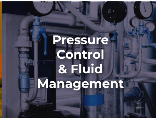
Pressure Control & Fluid Management