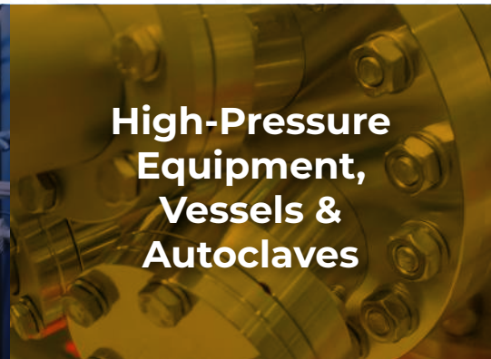
High-Pressure Equipment, Vessels & Autoclaves