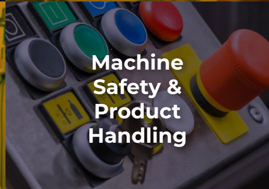
Machine Safety & Product Handling

Get in touch today and we can discuss the best engineering solution for your business